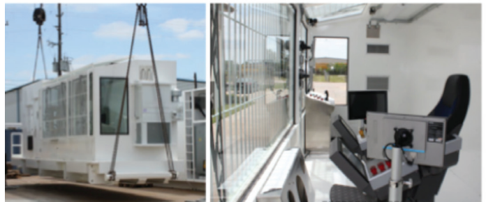
Figure 1: The Infinite Automated Drilling System from DePeuter Electrical Systems uses the SIMATIC S7-400H PLC as its core controller.

As shown in Figure 1, the Infinite drilling system comes fully integrated in a self-contained, transportable e-house that contains a driller's chair with sophisticated ergonomics, multiple touchscreens and joystick controls. A range of HMI screens (see Figure 2) enable the operator to choose the most suitable means of managing all the rig functions that are included.