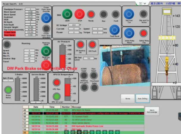
Figure 2: One of many HMI screens available on the driller chair's multiple touchscreens to operators of the Infinite system. Note the inset real-time video view of the Drawworks line drum.

Taking a closer look. More specifically, as shown in Figure 3, the complete Infinite system is built around a SIMATIC S7-400H PLC as the core controller, which was chosen for its fault-tolerant and redundant design. While the S7-400H PLC features redundant central functions, a separate hot standby can be incorporated as a fail-over resource in the event of a fault.